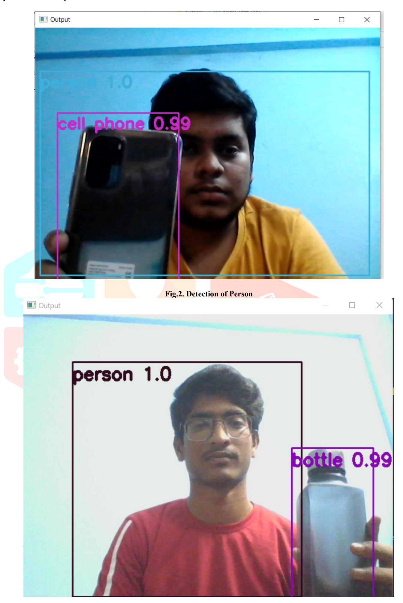
Fig:3 Detection of Person