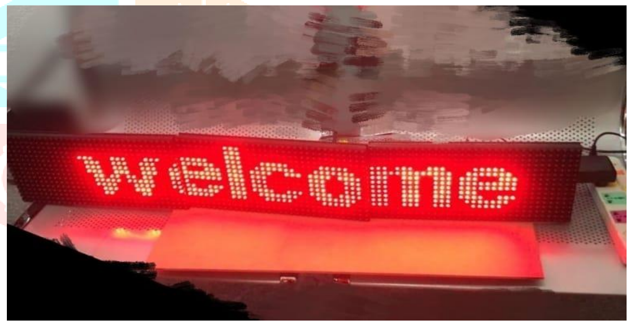
Fig 1 Final output of the notice board