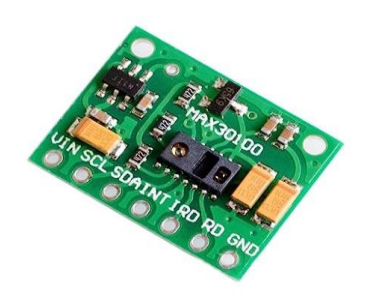
Fig. 3: MAX30100 Pulse Oximeter Sensor

Its major function is to read the absorption levels for both red light and infrared light sources and stored them in a buffer. Which can be read through I2C communication. Oxygenated blood absorbs more infrared light. So, it passes more red light. But, deoxygenated blood absorbs red light and passes more infrared light.