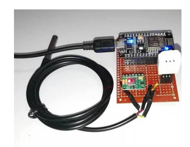
Fig. 6: Hardware Setup