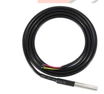
Fig. 3: DS18B20 One-Wire Waterproof Temperature Sensor

DS18B20 is a digital sensor, so there is no signal degradation in long distances. It is fairly precise, i.e. \pm 0.5 °C over much of the range. This sensor works great with any microcontroller using a single digital pin. The downside is it uses the Dallas 1-Wire protocol, which is complex and requires a bunch of code to communicate [11].