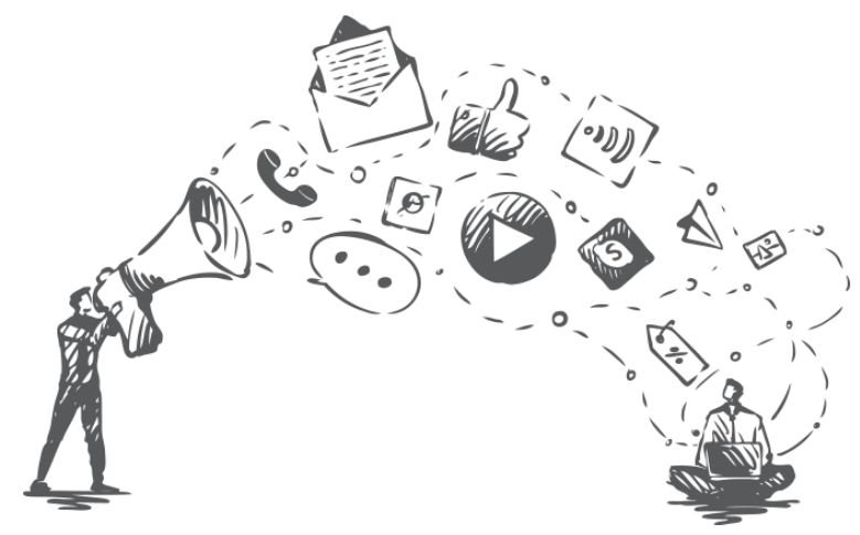
Figure-3. Overview of Advertising agency

The tremendous growth in this industry has dramatically increased the career opportunities in this field. The salary structure in advertising is quite high and if one, have the knack for it and, can slog it out, then one can command the price and most of the fields, the industry has been male dominated but the modern educated women are matching up to the standards. There is no dearth of job opportunities in this field and adequate qualification will open up wide horizons for both men and women alike.