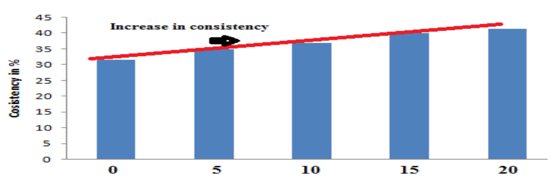
Percentage of Silica fume Figure. 1. Consistency of CF1 category