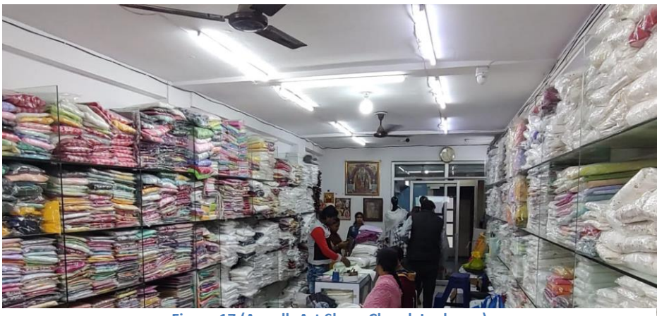
Figure 17 (Awadh Art Shop: Chowk Lucknow)