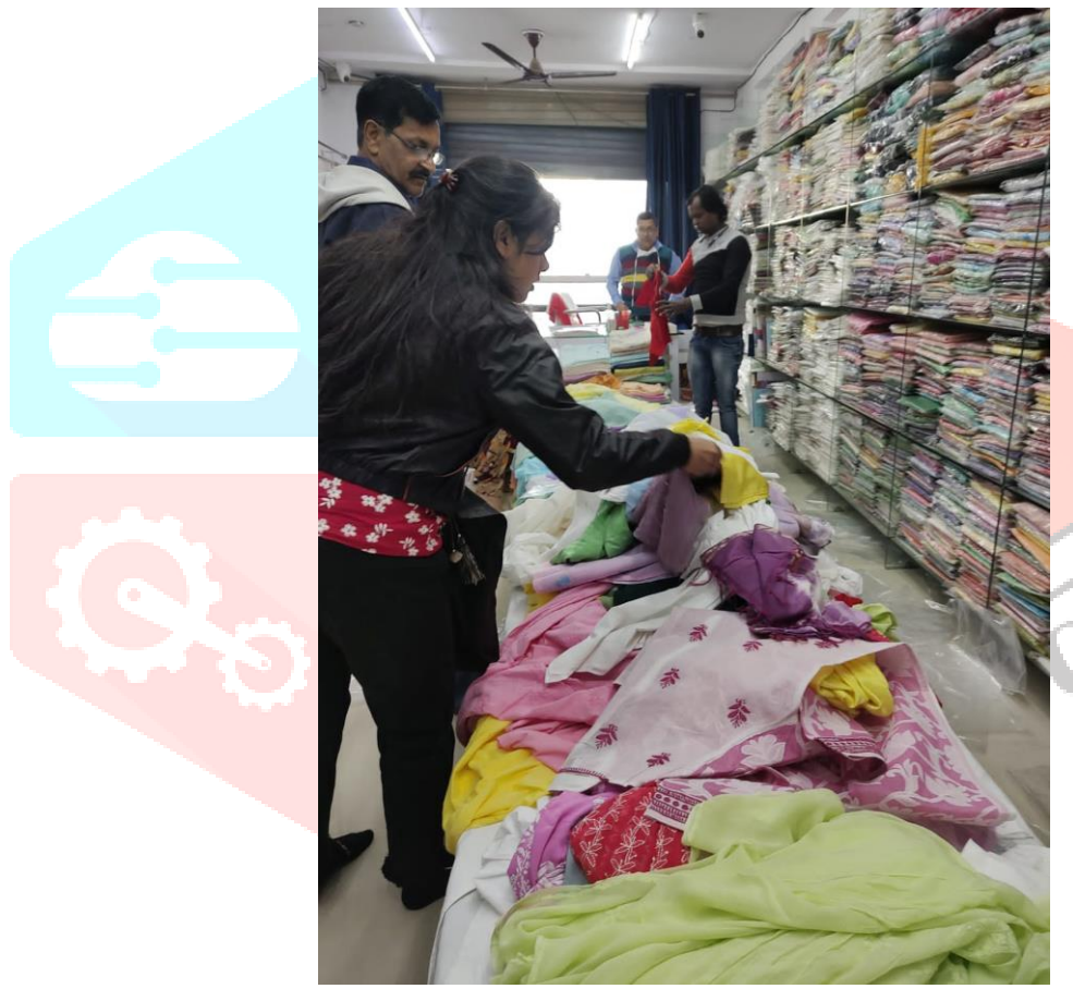
Figure 16 (Awadh Art Shop: Chowk Lucknow)

Analyzing the values of chikankari work was done for research purposes using a qualitative approach. Reports, surveys, and other sources have been used to acquire secondary data. Journal studies and academic papers. The research was conducted in order to analyse Lucknow's traditional handicrafts and get knowledge about its varied characteristics.