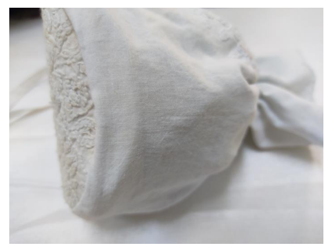
Figure 22 Figure 23