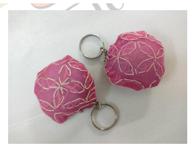
Figure 27 Figure 28