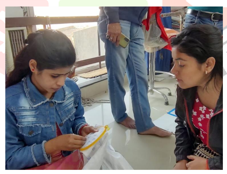
Figure 18 (Chowk Lucknow)

Primary data, it entails both the on-site survey conducted for an unbiased examination of the issue and dialogue with customers to ascertain how they view the issue: It will be necessary to choose appropriate sample markets and retailers that can provide a thorough picture of the market.