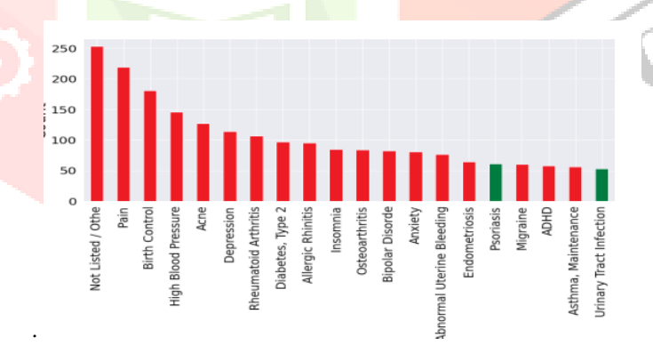
Figure 2: Most Recommended Drugs Per Conditions

The drug review sample used in this study was obtained from the UCI ML resource. This data consists of six components: the name of the drug used, the patient's rating, the patient's condition, a valuable number that indicates the number of people who experienced the benefit of the rating, the date the review was written, and a 10-star patient rating that indicates how the patient is doing overall satisfactory. According to the user's star rating, each review in this work has been categorized as positive or negative. Positive reviews are reviews with five or more stars, while negative reviews vary from one to five stars. In Figure 2, we can see the top medical conditions with the largest number of treatment options. One factor to observe in this figure is the fact that there are two green bars that indicate criteria that are of little importance.