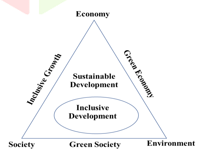
Figure 1: Exhibits the different dimensions of Inclusive Growth with respect to Economy, Society and Environment

The significance of this concept is clearly depicted by the meaning of this term. The term 'Inclusive Development' comprises of two words- inclusive and development. Inclusive means broad in orientation which include or encompasses all the things. So, inclusive development means a process of developing all the components of an economy. It covers the entire population irrespective of their demographic characteristics. It further develops a sense of belongingness and makes them feel valued without consideration of their level and status. The figure given below clearly shows the relationship between different elements of an economy which are essential to ensure the sustainable development.