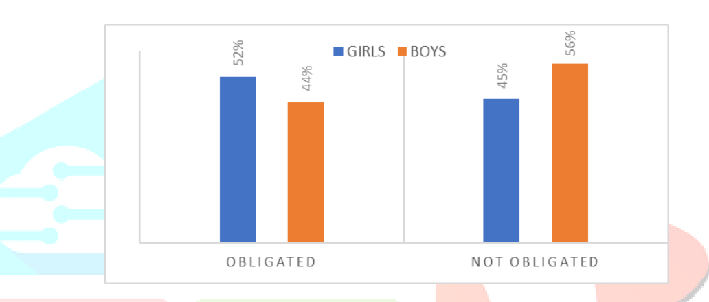
Figure 2. Bar chart view of data interpretation on questions of Personality