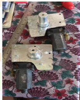
Drive Motor after Modification

The wheels used for the drive system are 17 cm diameter wheels which is made up of rubber and the rim is made up of hard plastic which provides great strength to hold on to the weights of the machine and easy movement of the machine.