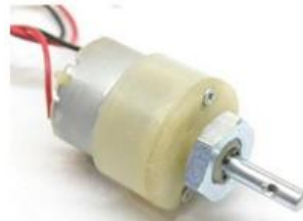
Centre Shaft DC Geared Motor 400 rpm

DC Motor – 400RPM – 12Volts Geared motors are typically made up of a simple DC motor and a gearbox. This can be used in all-terrain robots as well as a wide range of robotic applications. These motors have a 4 mm threaded drill hole in the shaft, making it simple to connect them to wheels or other mechanical assemblies. 400 RPM 12V DC geared motors are commonly used in robotics. Very simple to use and comes in standard sizes. The shaft has a nut and threads for easy connection, as well as an internally threaded shaft for easy connection to the wheel. DC Geared motors with a strong metal gearbox for heavy-duty applications, available in a wide RPM range, and ideal for robotics and industrial applications. Very simple to use and comes in standard sizes. The shaft has a nut and threads for easy connection, as well as an internally threaded shaft for easy connection to the wheel. The motor is mounted to the body of the machine using a motor mount that is available in the market. The mount is welded to the machine body for extra strength.