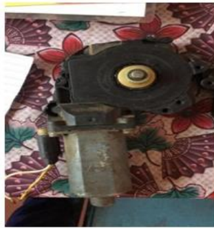
Drive System Motor

Since the shaft of the motor was made up of plastic and was small to connect the tire, we had to make some modification. The modification was preparing a new shaft from aluminum and customized casing of sheet metal is made to ensure the gears of the motor are all in contact and runs smoothly.