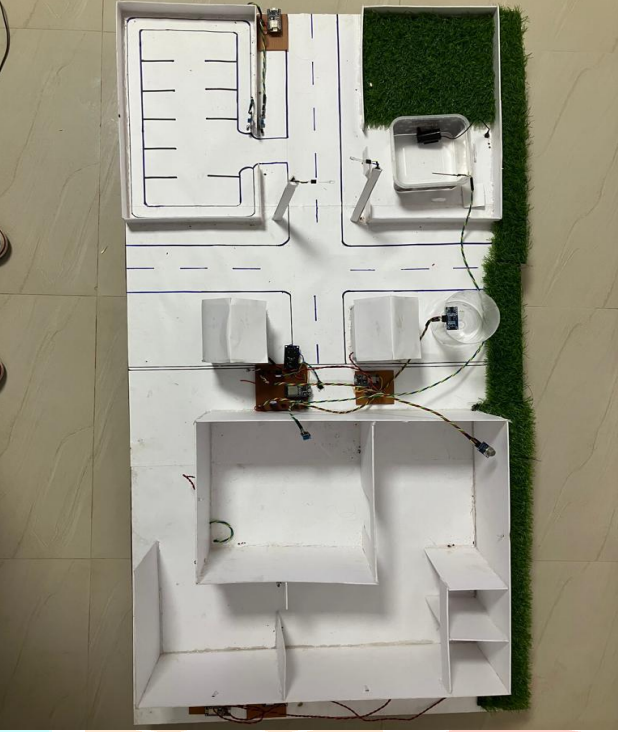
Fig. 3.9.1: Final Model of the colony.

For the final fabrication, we fabricated the model to completion and installed all the components and boards to it and made the wiring for the sensors and actuators. We then dumped all the code to the relevant boards and powered them all up. The project was running with all the objectives achieved and the data being readily available to the user from any part of the globe.