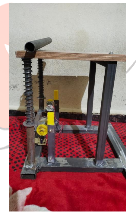
Fig:1FRONTVIEW 3. LITERATURE SURVEY