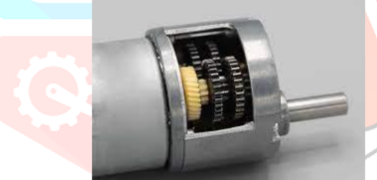
Fig: 3 DC Motor with gearbox

1000RPM 12V DC geared motors for robotics applications. Very easy to use and available in standard size. Nut and threads on shaft to easily connect and internal threaded shaft for easily connecting it to wheel.