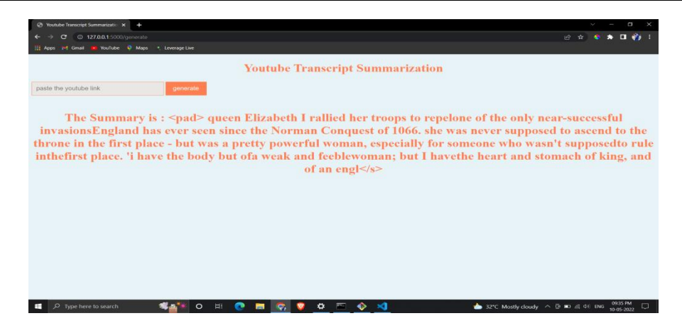
fig 3: Summarized Text generated