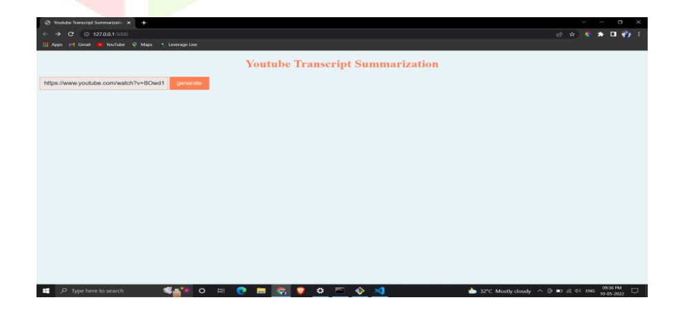
fig 2 :User interface to enter Youtube link