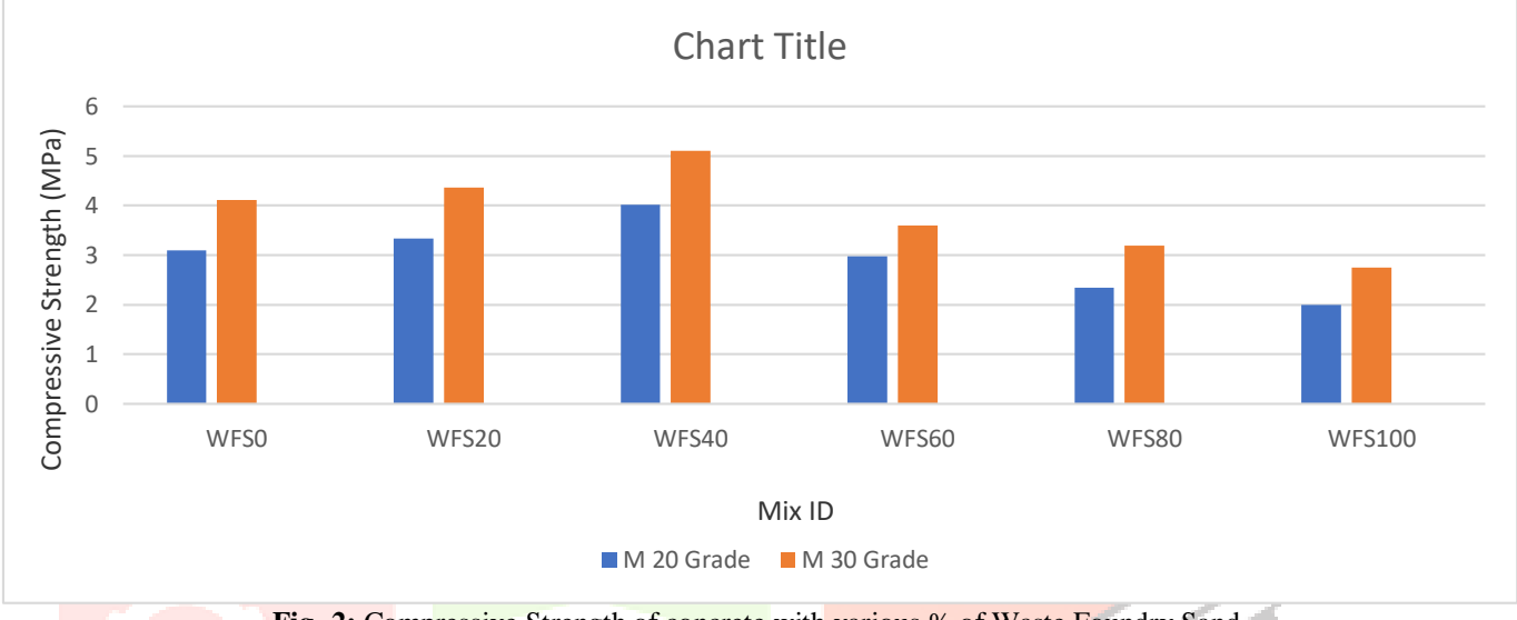
Fig -2: Compressive Strength of concrete with various % of Waste Foundry Sand.

Fig 2 shows that Split lastingness of 3.10 MPa for (M20 grade) and 4.11 MPa for (M30 grade) for management combine was achieved at 28 days. Split lastingness of concrete mixes inflated up to four-hundredth replacement of fine combination with waste factory sand.