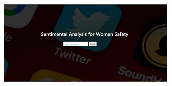
Fig. 2. Twitter API application website

To associate with the Twitter API and question most recent tweets to store them in the data set, make a record on Twitter apps.twitter.com/application/new and produce the programming interface keys expected to channel the program. The application settings are displayed in figure 2. Because of security reasons the API keys are not shown.