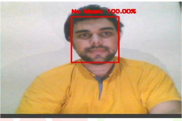
Above image is without mask.