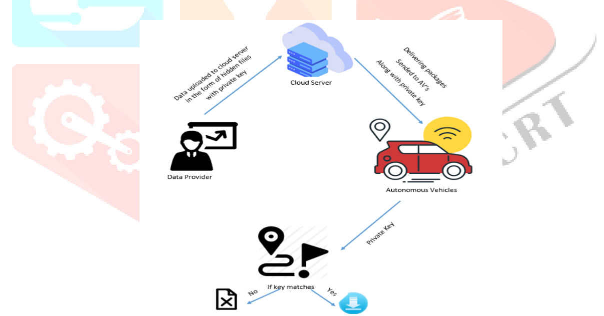
Fig 3.1 Proposed System's Arechitecture

To address current issues, we are adopting Cyber Security (CS) based data transmission to autonomous vehicles in the proposed system. Here, a cloud serves as the intermediary, transferring files from the sender to the autonomous car. For added security, we employ a CS-based algorithm (Advanced Encryption Standard) to encrypt the transmitted data into cipher text. The private key generated by the sender to the specific AV can decipher the encryption text.