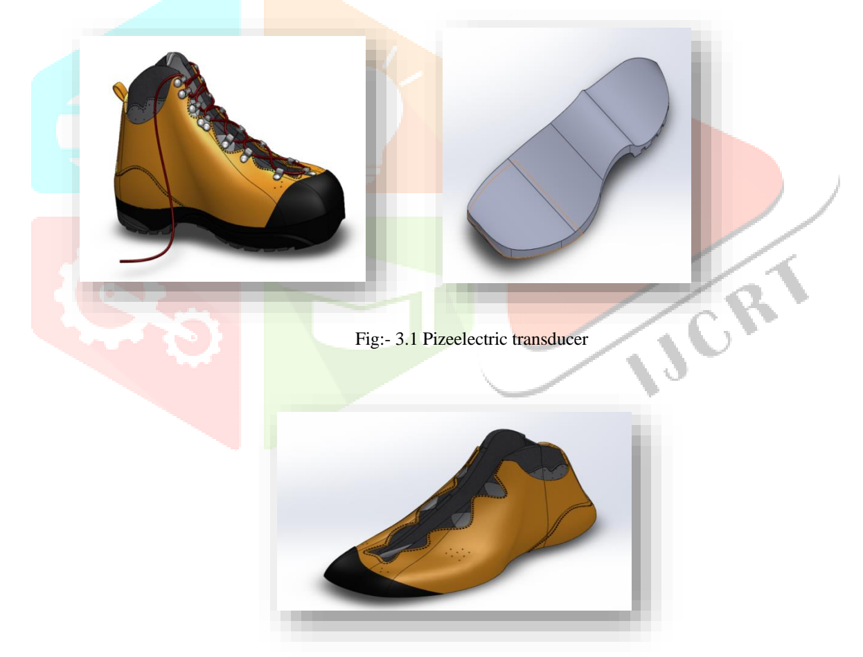
Fig:- 3.2 Assembly Drawing