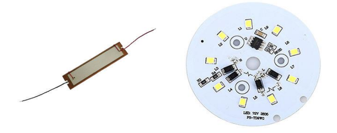
Fig 2.2 Waterproof Low Power Smd Pcb

The conversion of mechanical energy into electrical one is generally achieved by Dynamo - a convertor alternator. But there are other physical phenomena that can also convert mechanical movements into electricity, one of which is piezoelectricity. A transducer converts some sort of energy to sound (source) or converts sound energy (receiver) to an electrical signal.<sup>[1]</sup>