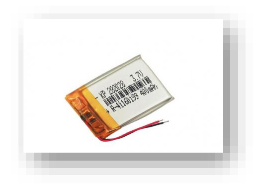
Fig 2.3 LiPo battery

We utilize LiPo (Lithium-Polymer) battery in this venture. Each cell of LiPo battery has a voltage of 3.7V, which works splendidly with Arduino Pro smaller than expected. There are numerous sorts of batteries as far as the measure and the limit. For a battery with current capacity under 100 mAh, it doesn't ensure stable power, which is too low to boot the framework. The battery should have circuit protection towards overcharging and overdischarging. The system is better to have a removable attachment. For the comfort, you can include LiPo charger module in underneath connection. It underpins accusing of USB and control out pins for Arduino. For this situation, some of source code must be adjusted.