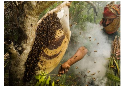
Fig. 1 Traditional method of Honey Harvesting

Presently, honey is extracted from honeycomb using tradition method. As shown in fig 1, the traditional method often involves squeezing of honeycomb leading to reduction in both nutritional value and quality; the unripe and capped honeycomb are collected at night, and the extraction is achieved by squeezing manually with the hand. It involves the use of bare hands with a knife to cut open the comb of the honey before extracting it into a container thereby damaging the honeycomb. The local procedures of using bare hands include the use of buckets or containers, match, dry leaves or palm kernel shaft, torch light, because the operation is done at night. After sitting the bee comb, put the dry leaves or palm kernel chaff on the caped comb and heat for few minutes to kill both the queen and the drones. Thereafter, an extracting knife is used to pull of the uncapped comb and then put inside the bucket or container. After the extraction, the honey is then taken home and pressed with the hands to separate the honey from the residue. The raw honey is filtered with a sieve to remove the remaining particles after this the honey is ready and fit for consumption [12].