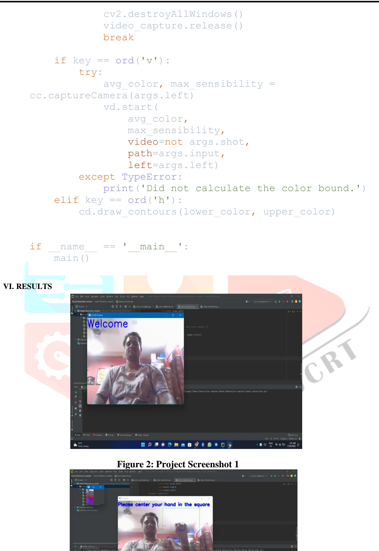
IJCRT2205885International Journal of Creative Research Thoughts (IJCRT) <a href="https://www.ijcrt.org">www.ijcrt.org</a> h544