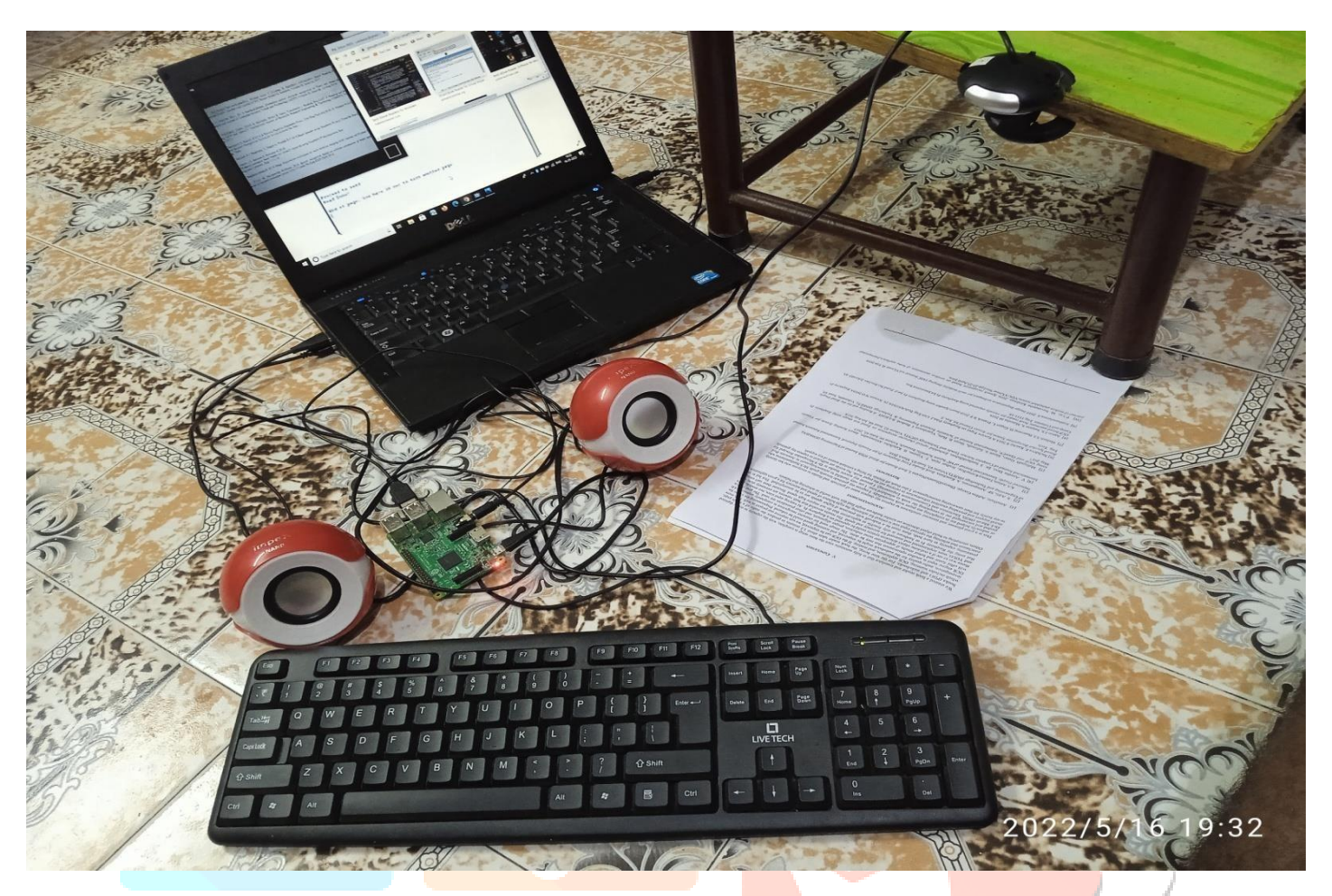
Fig.2.Hardware system setup Methodology:

A method is enabled to detect a sequence of characters that exist and display the current read Line. The OpenCV (Open Source Computer Vision) library is used to capture images of text and perform character recognition and more. The smart reader architecture is shown in Figure 1. Here is the text that the plastic sheet reads. Optical Character Recognition (OCR) is a technology used to convert captured images from written text to machine-coded text Digitizing text helps save storage space Because it takes time to edit and publish a text document written on paper, It is mostly used in analysis and storage purpose. Terribly it is used to turn documents to electronic files. Here OCR Technology is used for machine translation and text-tospeech process. At the end the recognized text document transforms to the output device.