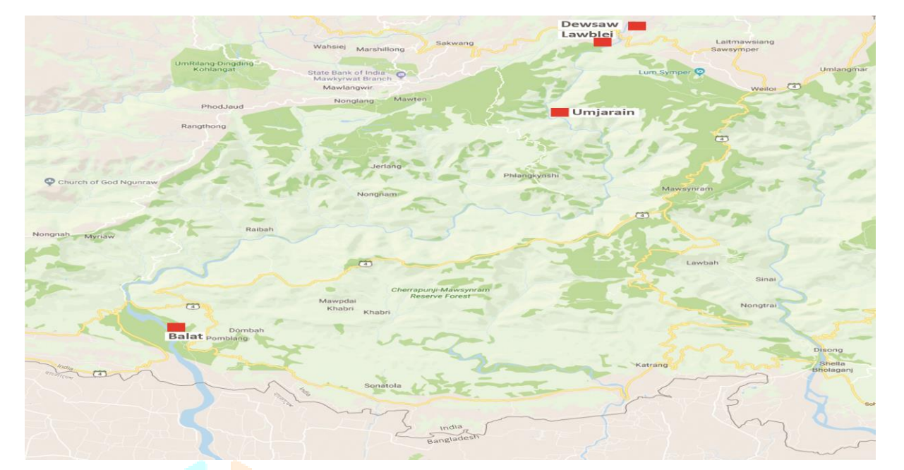
Plate II : Drainage pattern of meghalya with river Umngi