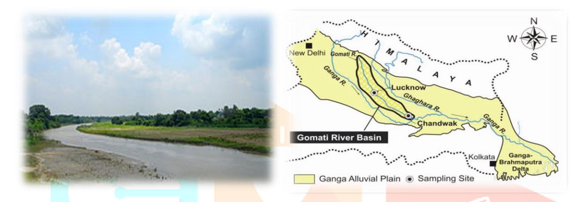
Fig 1. Location map of the Gomati River Basin

Pesticides are utilised at a rate of 60,000 MT per year in India, with the highest usage occurring around the river Gomti basin. Aside from the typical agricultural operations carried out along the Gomti basin, the river's dry beds are utilised to produce vegetables and fruits, and pesticides are added to the river during the monsoon season.