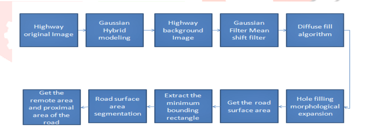
Fig. Street surface division

1. Street surface division -This part portrays the technique for roadway street surface extraction and division. We executed surface extraction and division utilizing picture handling strategies, for example, Gaussian combination demonstrating, which empowers better vehicle recognition results while utilizing the profound learning object identification technique. The expressway video picture observation enormous field of view. The vehicle is the focal point of consideration in this review, and the district of interest in the picture is accordingly the roadway street surface region. Simultaneously, as per the camera's shooting point, the street surface region is amassed in a particular scope of the picture. With this element, we could separate the thruway street surface regions in the video. The course of street surface extraction is shown