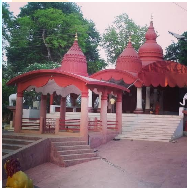
4. Kasba Kali Temple

Maharaja Dhanya Manikya (1940-1520) excavated a big pool of water in front of the temple and called it Kamalasagar after his wife Kamala Devi. The Durga temple of Kali Manikya evolved into a Kasba kali temple throughout time. According to legend, Nawab Hossain Shah of Bengal attacked Kasba but was defeated by the army of Maharaja Dhanya Manikya and fled to save his life. Currently, an Indo-Bangla Border Hut has been erected here, which serves as a distinctive attraction for travellers. Every year in April, a large fair is held near the temple, and hundreds of devotees' flock to perform puja in the temple.