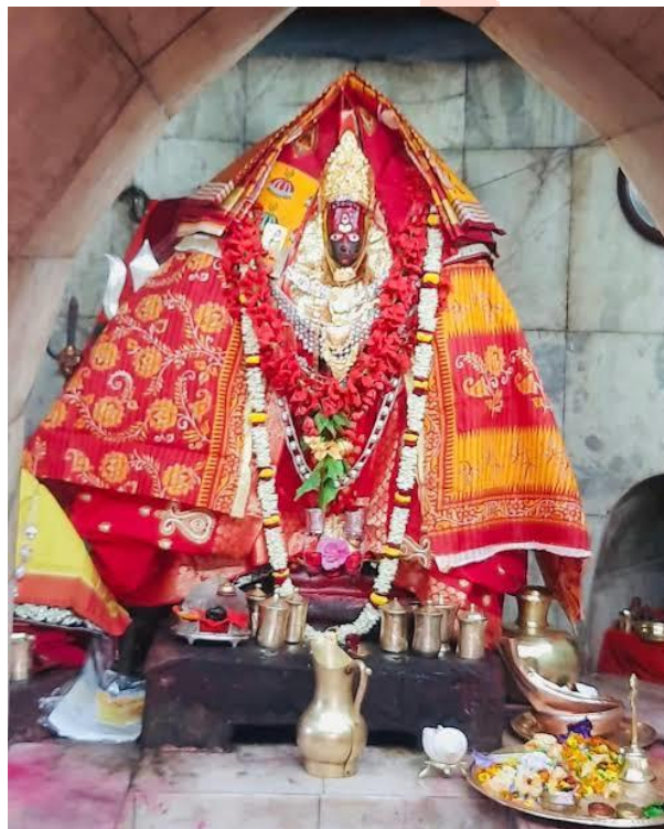
3. Maa Tripura Sundari