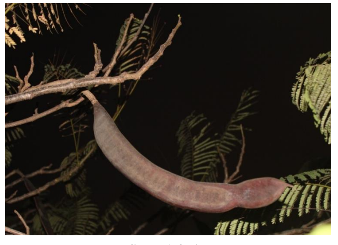
fig.no.5: branch & stems