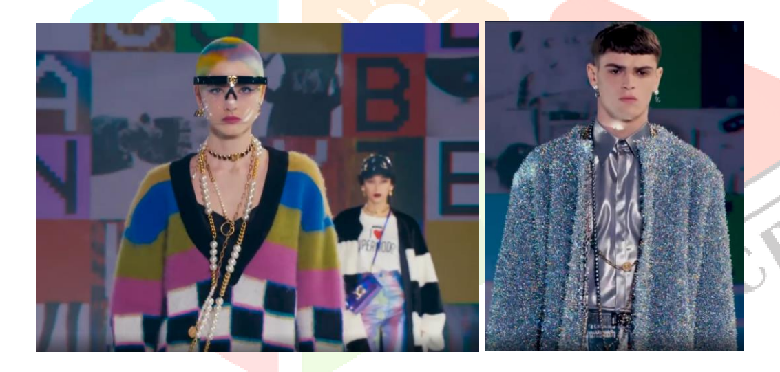
Fig 3: Dolce & Gabbana fashion presentation

The researchers "lent" the designers three iCubs (104 cm tall, 22 kg humanoid robots) and one android with artificial intelligence. After that, they changed clothes and walked back with the real models. The outcome was a futuristic fashion display, a true combination of creativity and ingenuity.