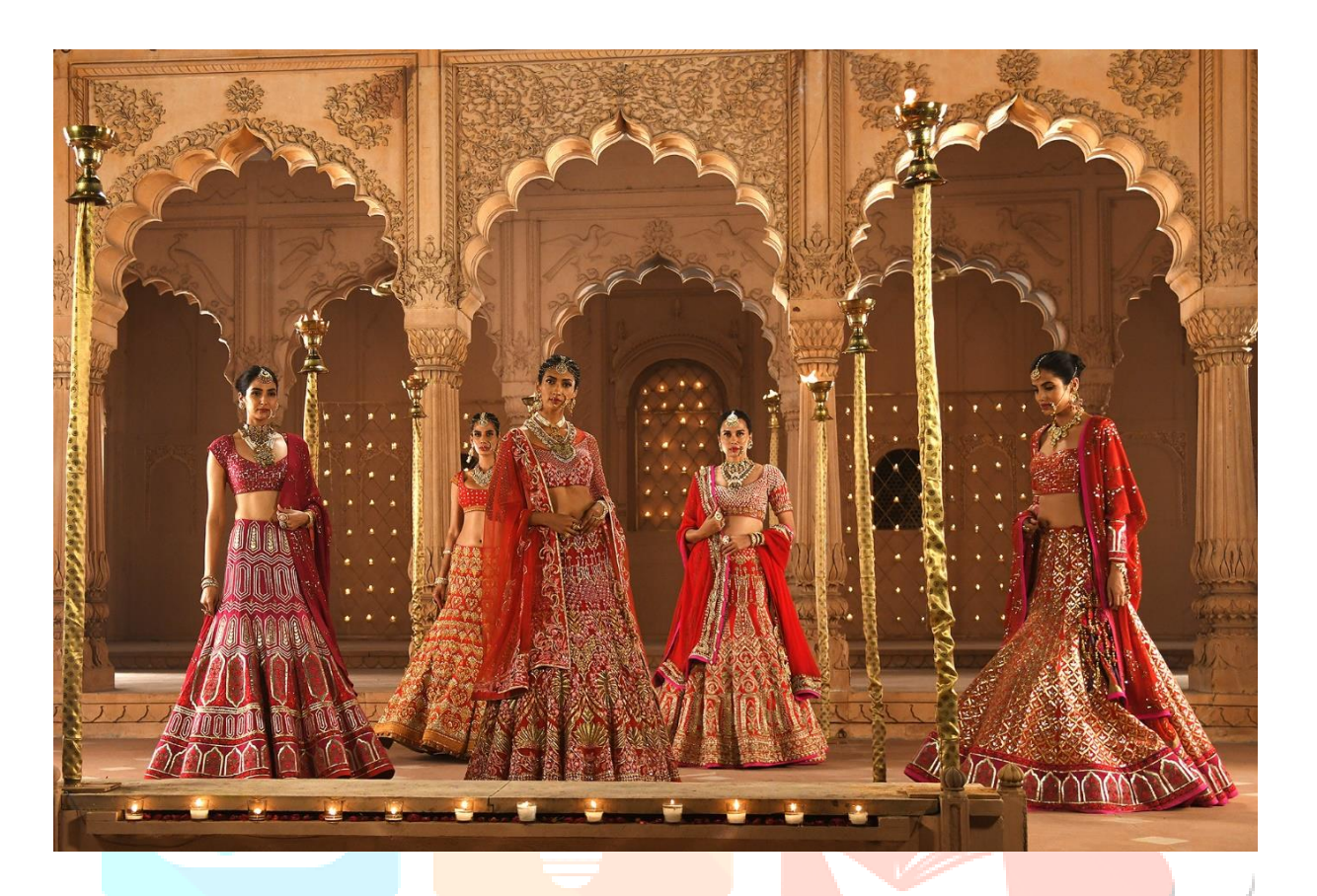
Fig 5: India's first virtual fashion show by FDCI

the designers as an alternative location for their shoot. Designers spent from Rs 10 lakh to Rs 40 lakh, with custom venues resulted in significant cost increases.