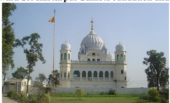
Fig.1.Gurdwara Sri Kartarpur Sahib, Pakistan