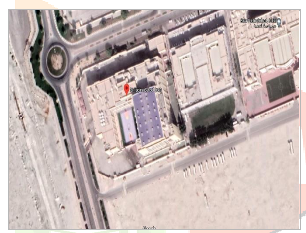
Figure 2: A satellite image showing Philippine School Doha.