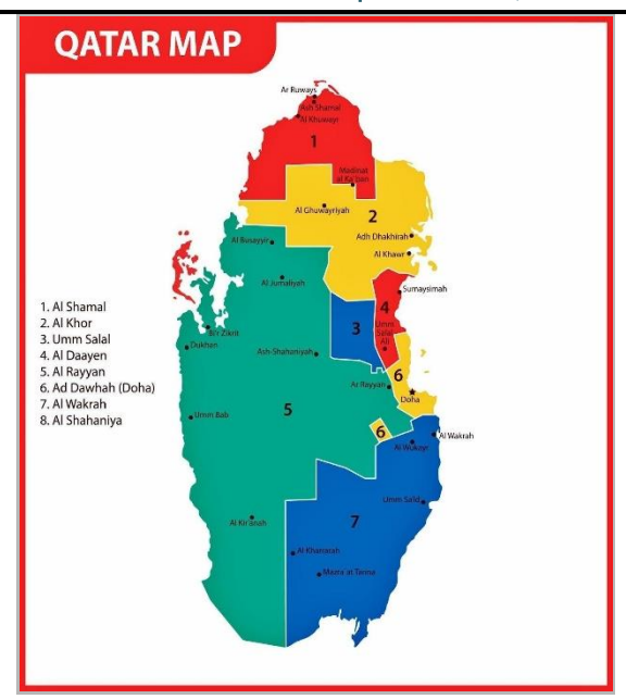
Figure 1: A map of the State of Qatar.