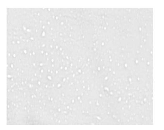
Image III: PBMCs Cultured Cells were dropped and viewed under a microscope (10X), it showed the more viable cells in two different fields.