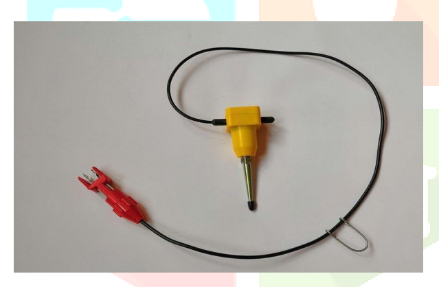
Fig 1. (Geophones)

Analog geophones are very sensitive devices which can respond to very distant tremors. These small signals can be drowned by larger signals from local sources. It is possible though to recover the small signals caused by large but distant events by correlating signals from several geophones deployed in an array. Signals which are registered only at one or few geophones can be attributed to unwanted, local events and thus discarded. It can be assumed that small signals that register uniformly at all geophones in an array can be attributed to a distant and therefore significant event.