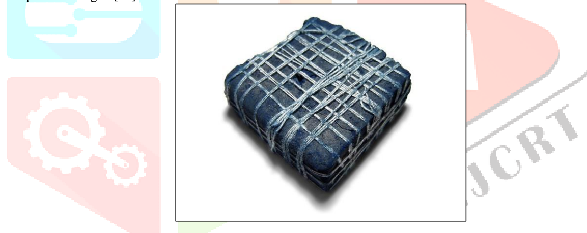
Figure 3 Indigofera Tictoria cake. Natural dye

Indigo was actually a plant that got its name because came from the Indus Valley, discovered some 5,000 years ago, where it was called nila , meaning dark blue. And by the 7<sup>th</sup> Century BC, people starting using the plant as a dye—the Mesopotamians were even carving out recipes for making indigo dye onto clay tablets for record-keeping. By 1289, knowledge of the dye made its way to Europe—when the Venetian merchant traveller, Marco Polo reported that many caravans travelling from areas of the Middle East and India contained cloths dyed with peculiars and precious "Indigo". This plant is used to create dyes for many different purposes, such as cloth dye, ink dye, and paint dye. It has the value of gold at one point of time in Europe. Early usage of indigo dye across continents are: Indigo tinctoria cultivated in Egypt Fifth dynasty [ca. 4400 BP), East Asia, and in Peru another type is known as "indigotin" a specie derived from the Indigofera native to South America [29]. In North America, Indigo plant was cultivated by Eliza Lucas Pinckney, a daughter of a British military officer, who received a package of seeds to attempt to grow it, after a couple of attends in 1744 was the first successful harvest of indigo in the South Carolina's [25]. She might not have known that other types of indigo species were very familiar to the native Central and South American, that have withstood the weather and insects better than the imported "indigo" [25].