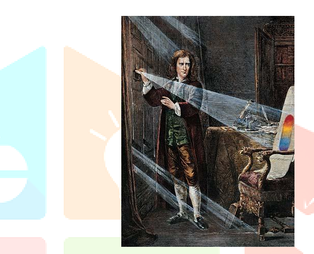
Figure 1 Sir Isaac Newton Experiment with A Prism. Engraving After A Picture By J.A. Houston, Ca. 1870.

This hue circle created by Newton of seven hues (ROYGBIV) does not correspond to the traditional pigment color circle of six hues: red, orange, yellow, green, blue, and violet (ROYGBV) [27], used in fine arts, where color correspond to the mixture of two existing ones and there is one type of blue hue only. In general, visible light widely vary under different condition as they render the color of the body object; this object will change because of the differences in the spectral reflectance of each source [32]. So, he studies the electromagnetic radiation, which is the form through which energy is transmitted, this natural light or sunlight is energy composed of electromagnetic vibrations of different wavelength travelling in all direction in undulating motion. The human eye is sensitive to light in the middle range of the visible spectrum and identify these hues such as green-yellow more easily (Holtzscue, 2006: 13). This is a narrow portion within the electromagnetic spectrum that can be seen by the human eye; other forms of radiations and wave of energy cannot be see included X-Rays, radio waves, gamma-rays, infrared rays, and microwaves. The eye is composed of cells which are sensitive to visible light spectrum, itentify by Newton's [21]. Since then, color theory and color notation have been developed and modified by the after followers of Newton time, at the foremost are scientists, artists, philosophers, physicist and chemists.