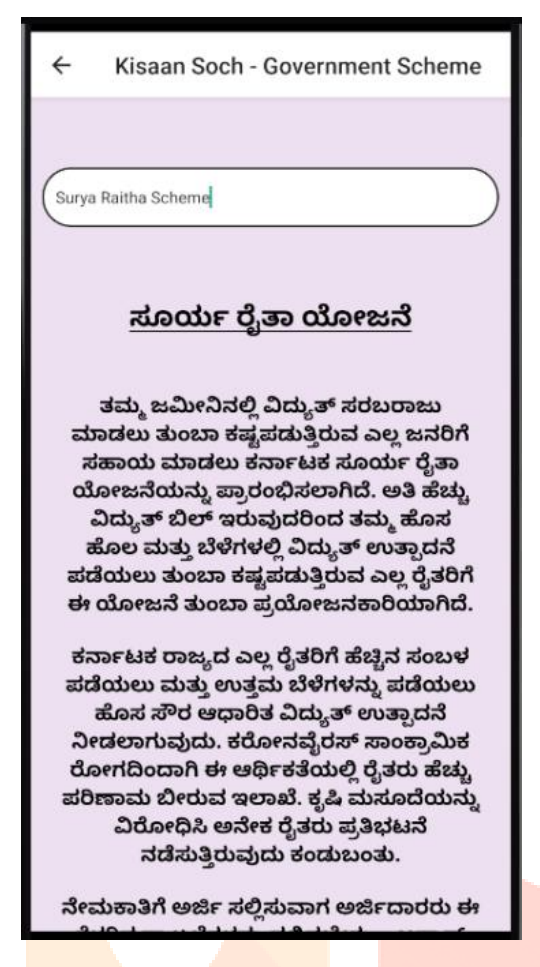
Fig 5 – Govt Scheme in Kannada