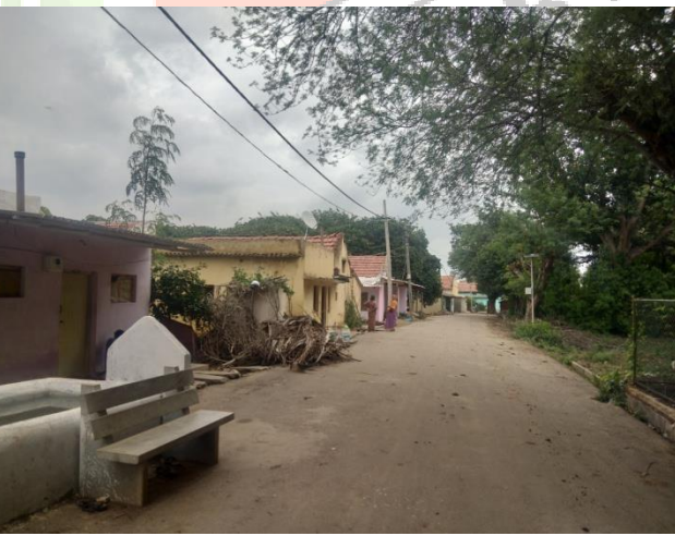
Tourist Birds Watching In Side Community Area