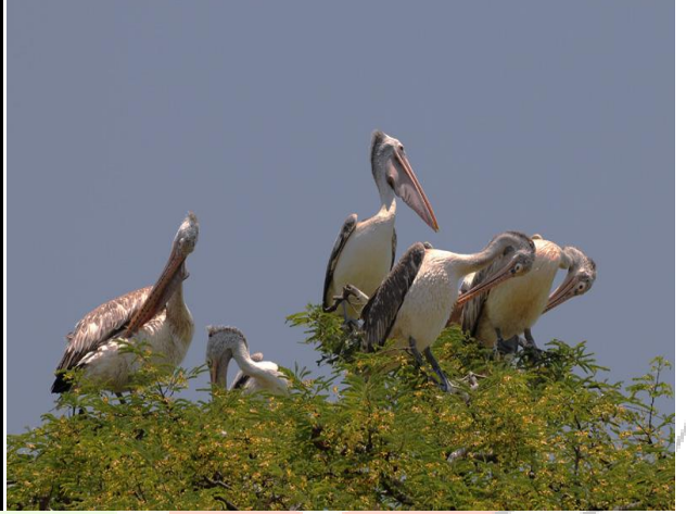
Storks Living Area (On Top Of the Tree)