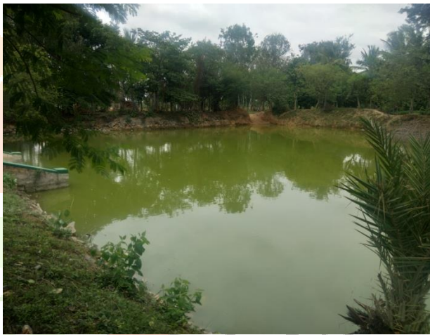
Man Made Pond