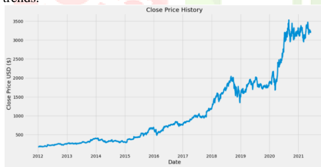
Figure 3. Closing Price Graph

Finally, we get a stock prediction model which we represented in form of a web app which makes investors, sellers and buyers to check stock market trends.