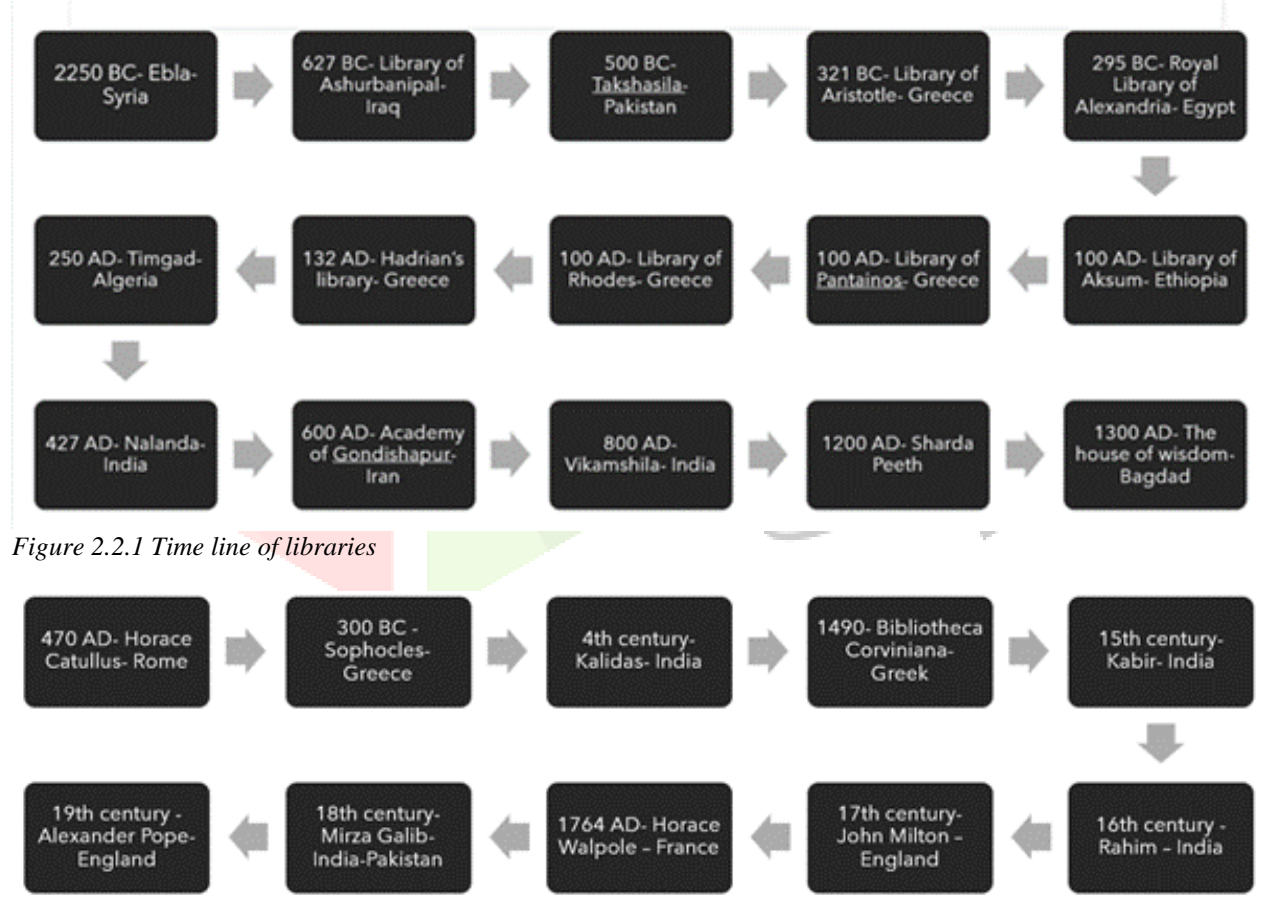
Figure 2.2.1 Time line of artist.

At the same time, the evolution of libraries through the ages in different parts of the world, from the first known Library of Ashurbanipal in Iraq to the plethora<sup>1</sup> of books we now have at our fingertips. Ashurbanipal was known as a martial commander of Iraq who also being literate was a passionate collector of texts and tablets. He hired scholars and scribes to copy texts mainly from Babylonian sources and used war loot to stock his library. The original motive mention "gain possession of rituals and incantations that were vital to maintain his royal power." Around 30,000 tablets and writing boards were found, some of them being severely fragmented. The library can be divided into two groups: historical documents, religious texts, mathematic, epics and myths and legal documents.