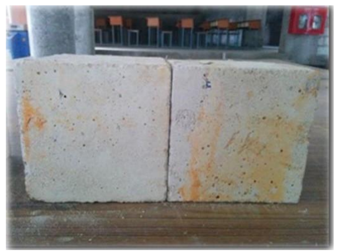
Fig 1: Hydrochloric Acid Attack on Concrete

Ordinary Portland Cement (OPC) is highly alkaline in nature with pH values above 12. When the cement paste comes into contact with the acids its components break down, this phenomenon is known as acid attack. If pH decreases to values lower than stability limits of cement hydrates, then the corresponding hydrate loses calcium and decomposes to amorphous hydrogel. The final reaction products of acid attack are the corresponding calcium salts of the acid as well as hydrogels of siliceous, aluminium, and ferric oxides.