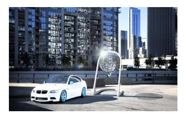
Fig.5Application of Spherical Sun Power Generator