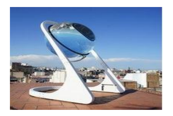
Fig.2 Structure of Spherical Sun Power Generator

The typical structure of Spherical Sun Power Generator isshown in Fig.2.