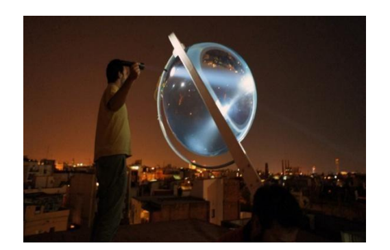
Fig.4 Operation of Spherical Sun Power Generator

Solar start-up Raw lemon aims concentrator; it operates at efficiency levels of nearly 57% in hybrid mode. At night time the Ball Lens can transform into a high-power lamp to illuminate your location, simply by using a few LED's. The station is designed for off grid conditions as well as to supplement buildings' consumption of electricity and thermal circuits like hot water.