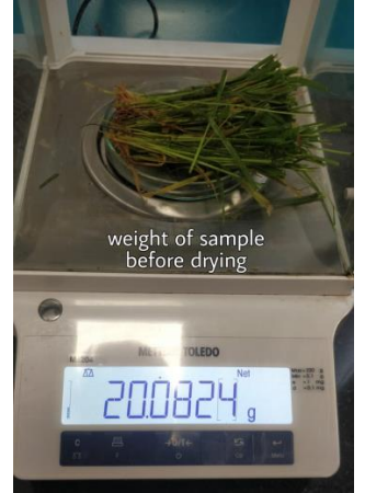
Figure 21: weight of sample before drying

Figure 20: Formula for calculating moisture content