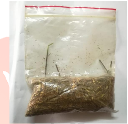
Figure 12: little millet straw during urea treatment inside airtight bag