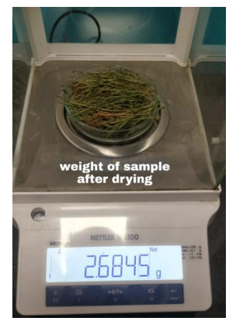
Figure 22: weight of sample after drying