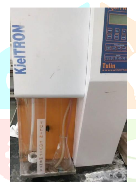
Figure 15: KjelTRON<sup>TM</sup> - Rapid Automatic Nitrogen Estimation System (Nitrogen Analyser) – Distillation Unit

This method was first introduced in 1883 by Johan Kjeldahl to estimate the nitrogen content in various organic and inorganic substances.