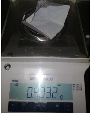
Figure 8: Urea crystals

For this project, Great indo gardens® UREA 1000gram Urea NPK 46:0:0 plant Fertilizer to use it as a nitrogen source for the little millet straw for nitrogen enrichment. The product has been purchased from E commerce website, amazon.com, Inc.