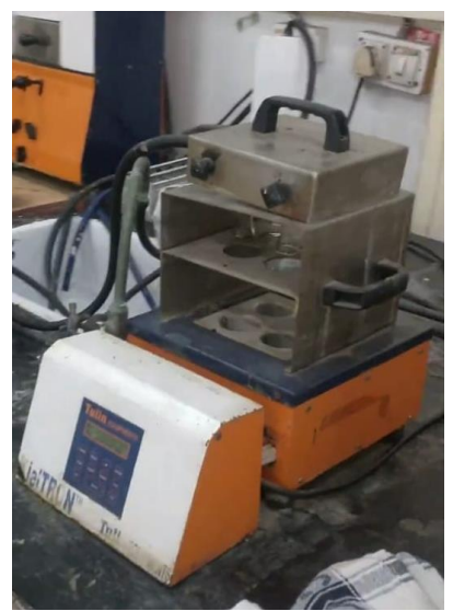
Figure 14: KjelTRON™ - Rapid Automatic Nitrogen Estimation System (Nitrogen Analyser) – Digestion Unit