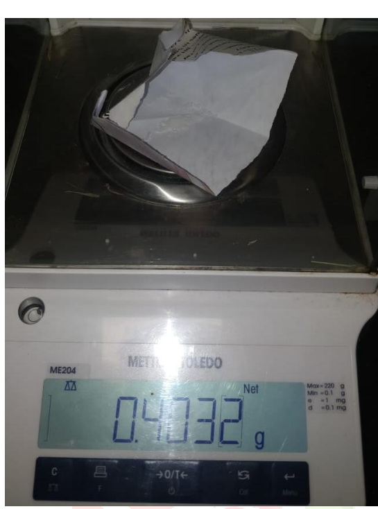
Figure 9: weight of urea used