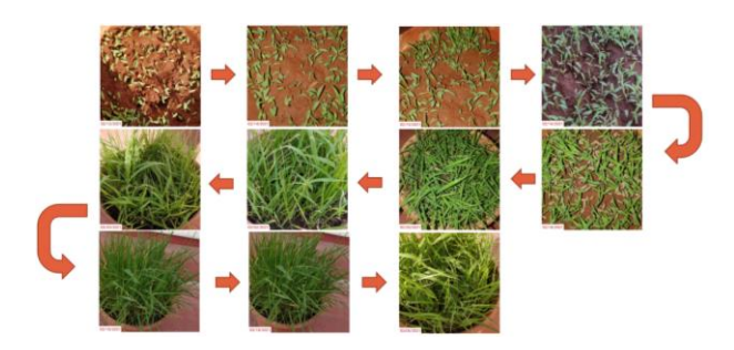
Figure 5: growth of little millet plant

The plant has been daily watered with groundwater with ph7.20 inside a 9x17 inch claypot. The plant has been grown under normal temperature conditions (high 32°C and low13°C) and only external fertilizer is used additionally which has been mentioned above. The entire 38 growth period of the plant can be seen in figure given below from 12th February 2021 to 5th March 2021