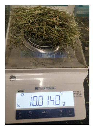
Figure 11: weight of sample used for enrichment