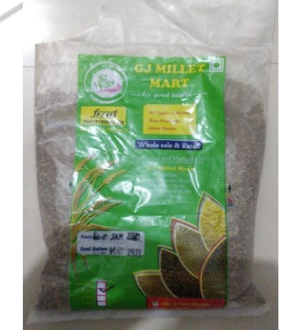
Figure 4: GJ MILLET MART® Organic Little Kutki Seeds for Sowing (little millet seed)

For this project, GJ MILLET MART® Organic Little Kutki Seeds for Sowing (1 Kg) is used to obtain little millet straw from mature little millet plant. The product has been purchased from E commerce website, amazon.com, Inc.