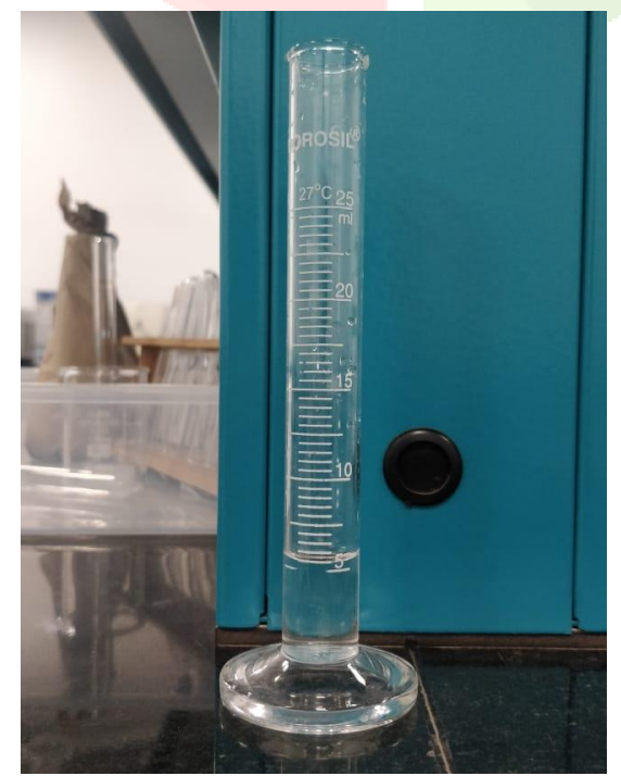
Figure 10: Amount of distilled water used