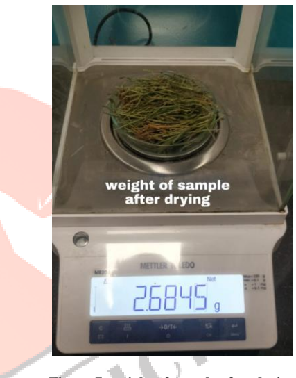
Figure 7: weight of sample after drying