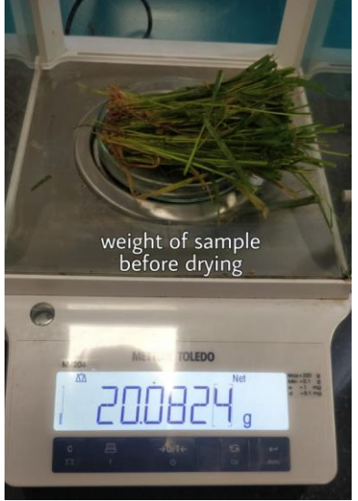
Figure 6: weight of sample before drying

9. After the drying is successful, note down the dry weight of the sample and then calculate its moisture content.