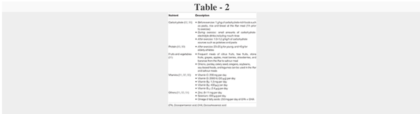
Table - 2 . Practical nutritional guidelines for adult athletes, who are eager to fasting under the Covid-19 pandemic situation.

Beside carbohydrate, post-exercise protein ingestion has some benefits on immune responses to exercise and skeletal muscle recovery. Fasted individuals can intake 20–25 grams of high-quality protein soon after the exercise bout to provide adequate plasma essential amino acids which are important for many training adaptations through the synthesis of new protein structures (e.g., myofibrillar, sarcoplasmic and mitochondrial contents) during the recovery period. Fast digesting proteins (e.g., whey component of milk) may be a good choice to increase the plasma leucine content after exercise. Table - 2 summarizes in general the potential nutritional suggestions that may result in better exercise-induced outcomes during Covid-19 outbreaks in the month of Ramadan.