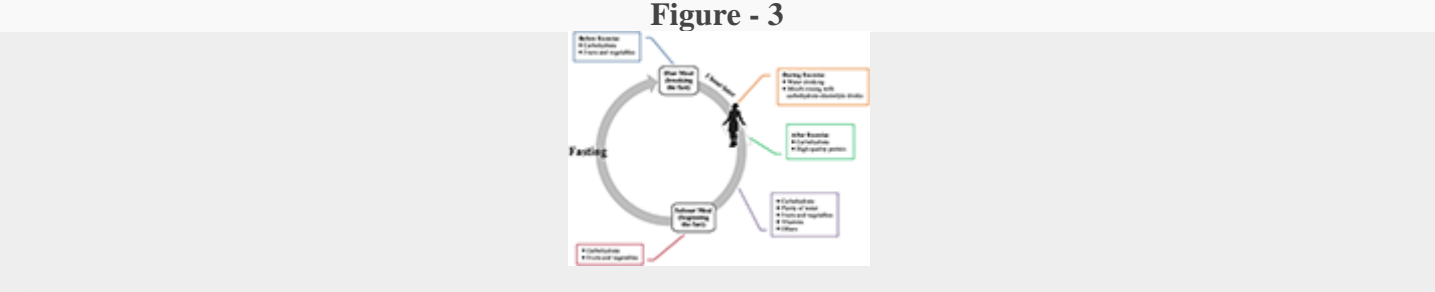
Figure - 3 . Timing of required nutrients, during Ramadan with an emphasis on physical exercise training.

ingesting some functional foods (e.g., carbohydrate, protein, polyphenols, vitamins, and minerals) and fluids together with suitable timing (Figure - 3) in order to help maintain physical exercise performance and immune function without causing harmful side effects on health.