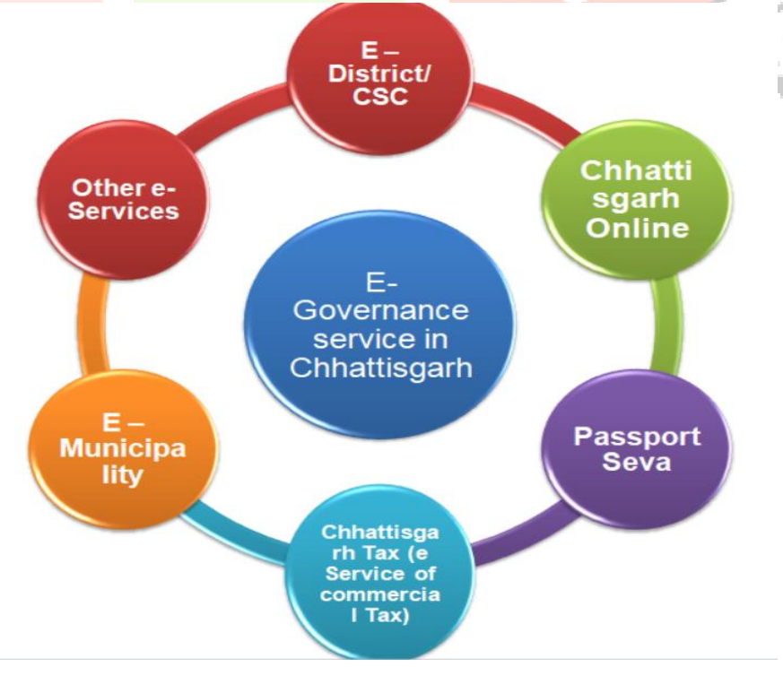
Fig 2: Categories of e-Governance Services in Chhattisgarh state

After reviewing the literature, identified several e-governance services available in Chhattisgarh state and categorized as shown in Fig 2.