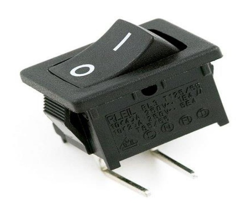
Figure 4: Switch

A single pole signal throe switch serves in circuit as on -off switches. It has only one input terminal and one output terminal.