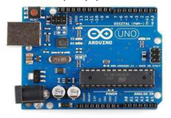
Figure 1: ARDUINO UNO BOARD

with 5volts offer returning from transformer. The program is uploaded with USB jack with acceptable code needed for style of project.