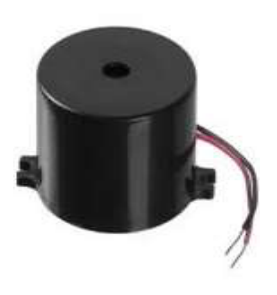
Figure 3: Buzzer