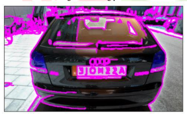
Fig 8: Detecting plate

Next step is draw contours to detect rectangular edges. We pass the above fig as input to this, so it produce the output as shown below.