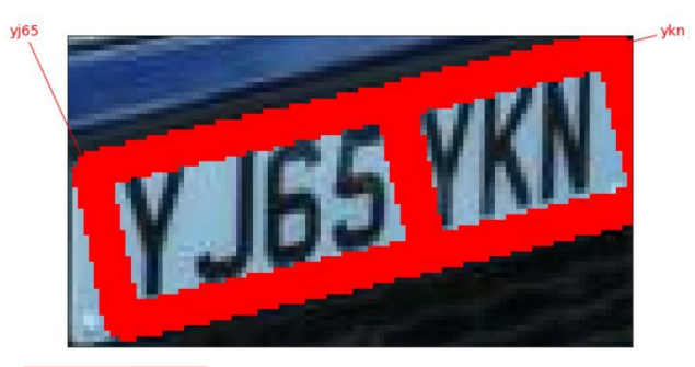
Figures 9,10,11,12 showing number plate.

Example for angled number plate detection