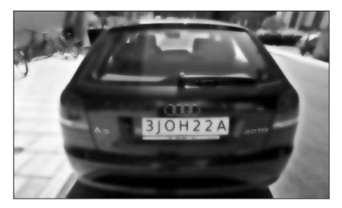
Fig 6: Blurred gray image