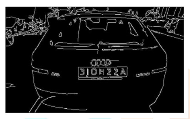
Fig 7: Edge detection

Here we pass the above fig as input to the Canny method which is available in openCv. It detects the all the edges as shown below.