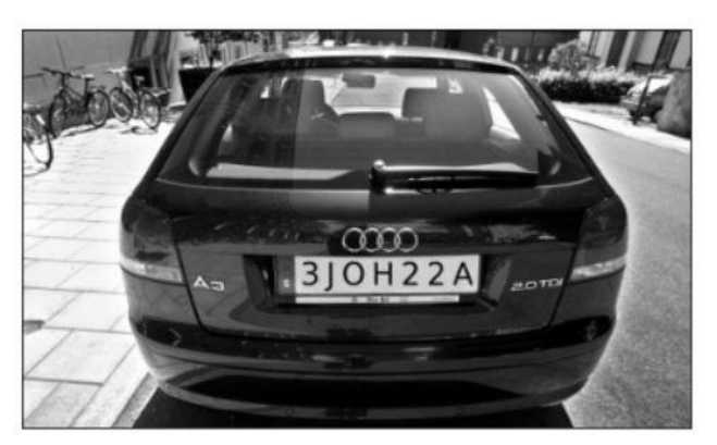
Fig 5: Gray image

before the main image processing, pre-processing of the captured image ought to be taken out which include converting RGB to gray, clamor evacuation, and border enhancement for brightness.