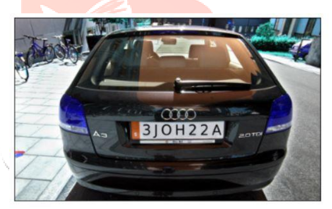
Fig 4: Input image

The initial step is to receiving input image. These Caught images are in RGB format so it can be further process for the Number Plate Extraction.