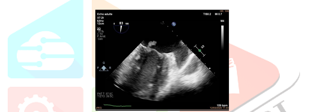
Figure 2: Transesophageal echocardiography showing hyperechoic elements on the atrial side of the small mitral valve with a false prolapse of P2.

Figure 1A, 1B: Echocardiography showing a hyperechoic element appended to the distal end of the large mitral valve on the ear slope measuring 19.7x11.5mm.