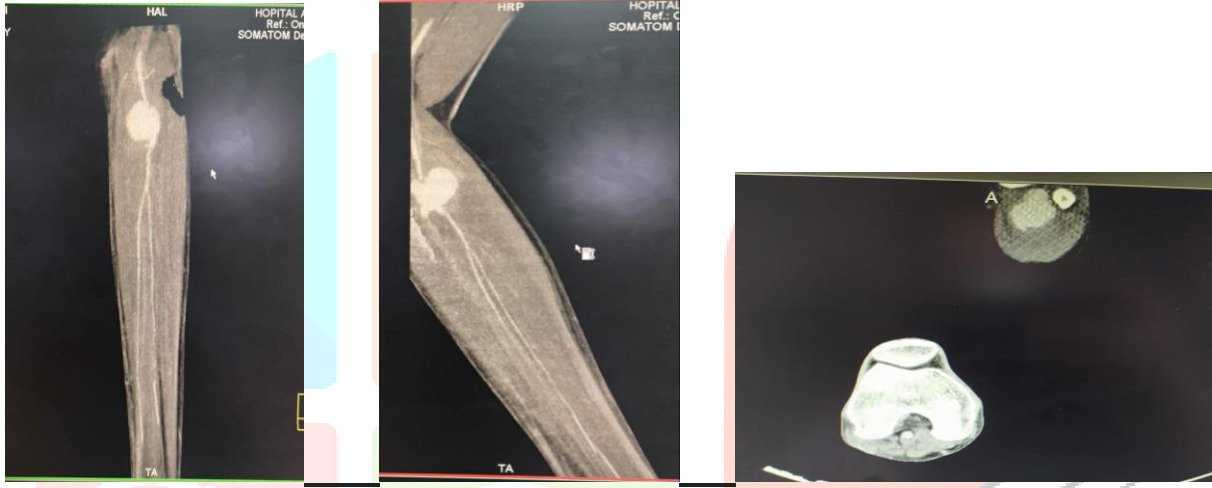
Figure 5AFigure 5BFigure 5CFigure 5:Angiography of lower limbs showing a false left popliteal aneurysm.

Figure 4AFigure 4BFigure 4:MRI of the left ankle showing talo-calcaneal arthritis with Achilles bursitis.