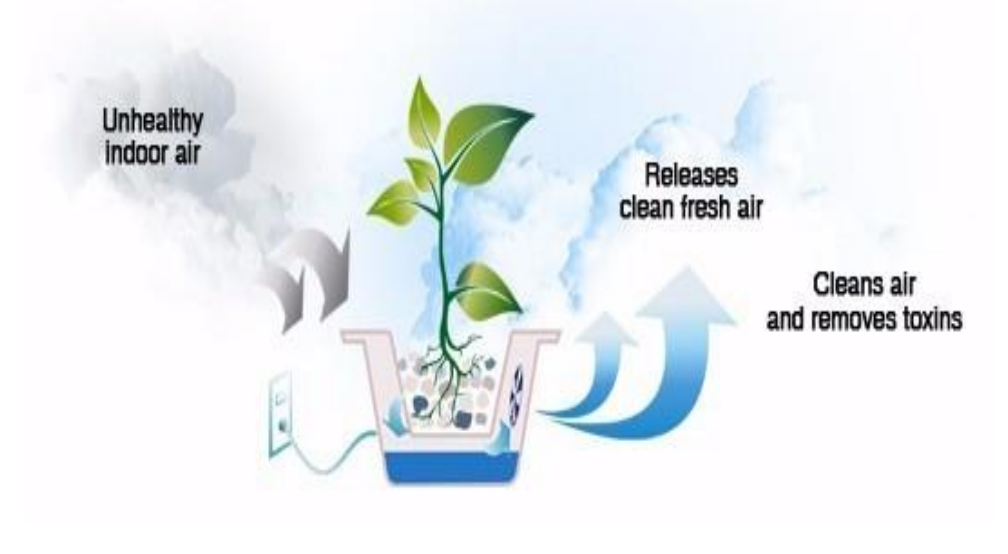
Fig2 Working of the air purifier

Our approach is to make this project more user friendly by using IOT technology. This idea will be implemented on NodeMCU board. It will be programmed using arduino ile. For this idea, we decided to use a fan to create an air depression under the pot. If the air under the soil has a lower density than the one from above, it will naturally flow through the dirt. The fan will through air out of the decorative pot so the pressure in the area between both pots is lower than outside. We will add to our system a MS1100 sensor that is able to detect Formaldehyde, Toluene and several others unhealthy particles commonly found in indoor air. We will also add a DHT11 to detect humidity and temperature, and gathered general data about the environment. To easily read and manage these data, we will link NodeMCU to the Blynk application. These values will be shown on the Blynk app interface and can also be controlled with the Blynk application. This way, we can directly read the curves from any wifi device. This will make our air purifier more user friendly and interactive.