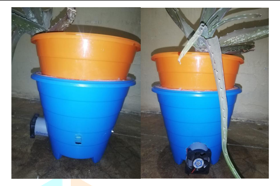
Fig3 Implemented system