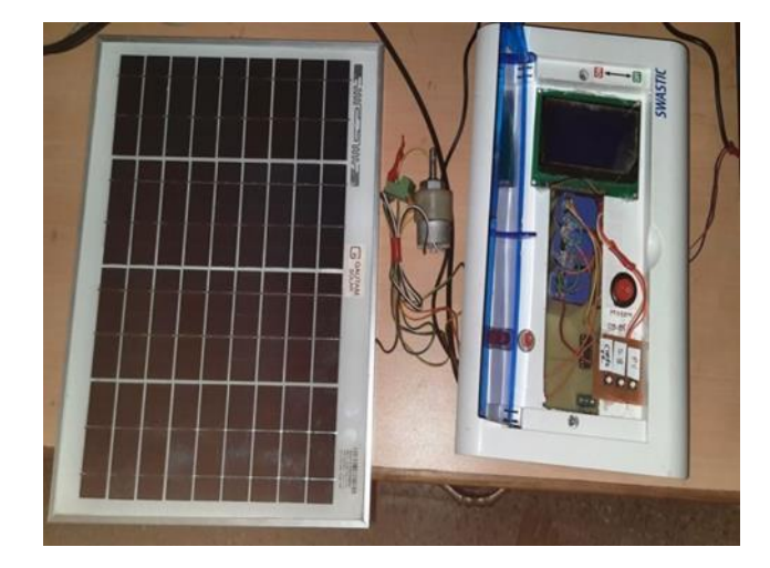
Figure-3 Hardware Model

A photograph of the experimental setup constructed at the laboratory is shown in Figure-3