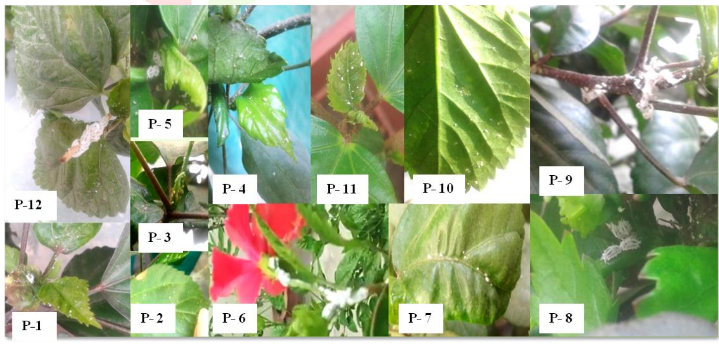
Figure 2 Selected plants before treatment (day 0)

This figure showed the comparison of % mortality of selected plant based homemade insecticides (plant extracts). The bestresults were obtained in garlic and lemon juice foliar spray application. Because this plant extracts contain concentrated acid which are more effective than other aqueous solutions.