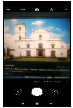
Figure 5.3 Camera screen