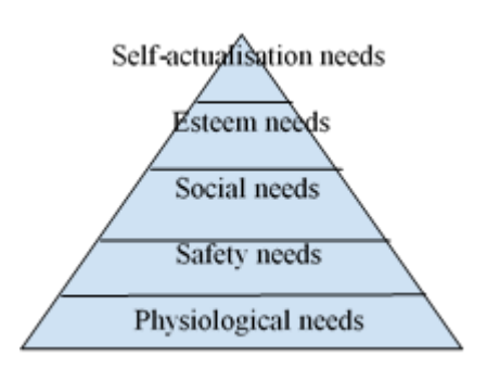
Figure 1: Maslow's Hierarchy of Needs

Marketing mix is a stimulus which makes consumers more aware of their needs. Marketers employ marketing mix as tactic tools for strategy and delivering customer value at the excellent level, delight, and such marketing mix is used together to cater to the needs of target market. Marketing mix comprises 4 tools or 4Ps as shown below.