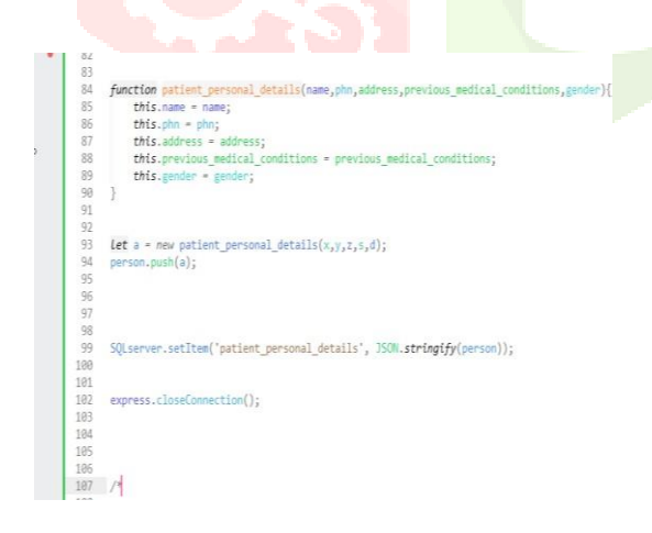
Fig 8: REST API function using JSON

Our diagnosis application has a huge role of rest API as it contains a good amount of transfer of data from patients, doctors, AI engine, databases, etc. Back and forth and therefore it was mandatory to build an API that may built as a class so as to inherit its properties and make code more reusable as the application is very data intensive and without code reusability the complexity of the application will reach to heights. Here's an example of how various patient details are firstly converted to JSON string and then routed. [6]